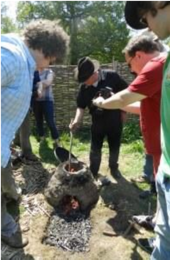
Filming the kiln in action

‘Once the fuel began burning, and with careful stoking and sustained bellowing of air inside, a temperature of around 900 degrees Celsius was reached remarkably quickly. Although this core temperature fluctuated, it remained at between 800 and 900 degrees for about one and a half hours – providing the conditions thought ideal for the compounds in the faience to produce a glaze.