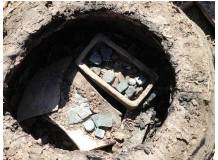
Inside the kiln, once the lid had been removed from the saggar

faience mixture been dry enough? Had the temperature been right? Was there enough bellowing?