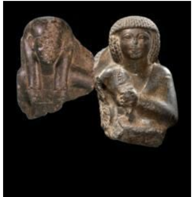
Egyptian Pair Statue - Husband and Wife

Ancient Art exhibition in the 10th annual Brussels Ancient Art Fair this June. The two pieces depicting a husband and wife will be examined together in an effort to determine a possible match.