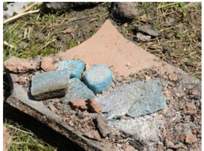
Success: the distinctive blue of Egyptian faience.

The results were astonishing: most of Alan’s greyish samples had turned bright Egyptian blue. Although the material remained rather porous, and did not show the shiny glaze typical of pharaonic examples, the experiment was declared a success. Conditions not dissimilar to those used in ancient Egypt had produced a passable imitation of this popular material.