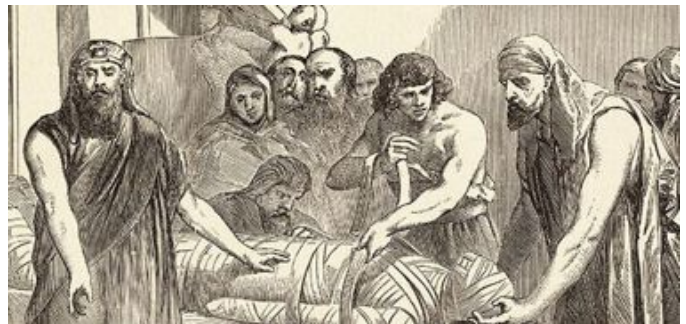
Egyptians embalmng a corpse.